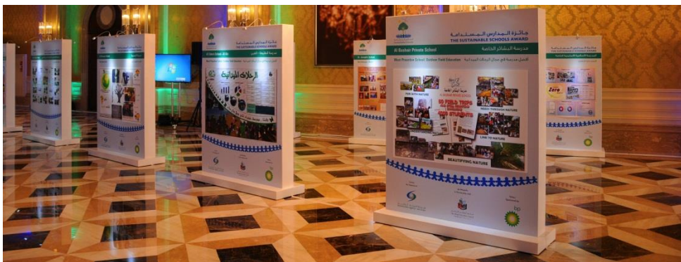
Schools display their work at the Pre Function Exhibition Area

The last date for this year's award submission is August 5 th , 2013